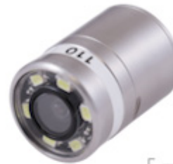
110° Lens included. Additional lenses available.

Multiple options are available for the control unit including a portable 7" Monitor Controller or a Desktop Controller made from rugged anodized black aluminum with non-slip rubber feet. Both options include built in storage and DVR with full image capture, recording and playback capabilities along with multiple outputs.